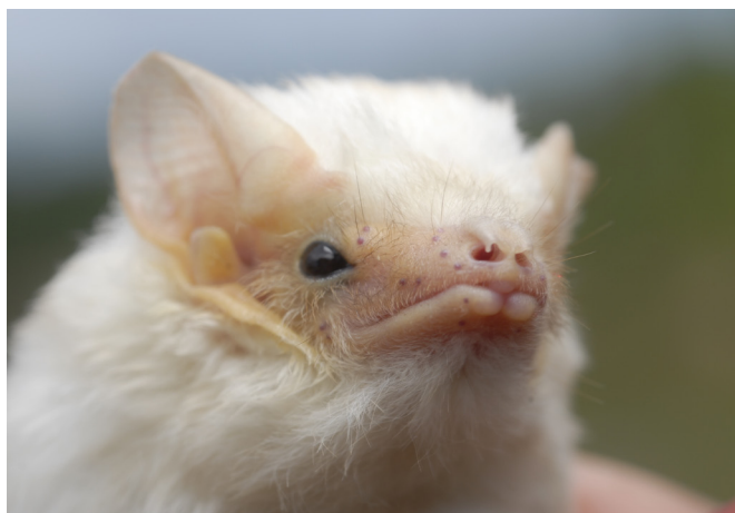
FIGURE 2. Live photograph (MUSM 37068 - ♀) of the little ghost bat, Diclidurus scutatus , collected at the mouth of Lago Preto, Lago Preto Conservation Concession, Yavarí river, Loreto, Peru.

b Measurements provided by Albuja (1999), Husson (1962), and Sodré and Uieda (2006) and from the following specimens ROM 34575, 38505 and FMNH 88234–88235.